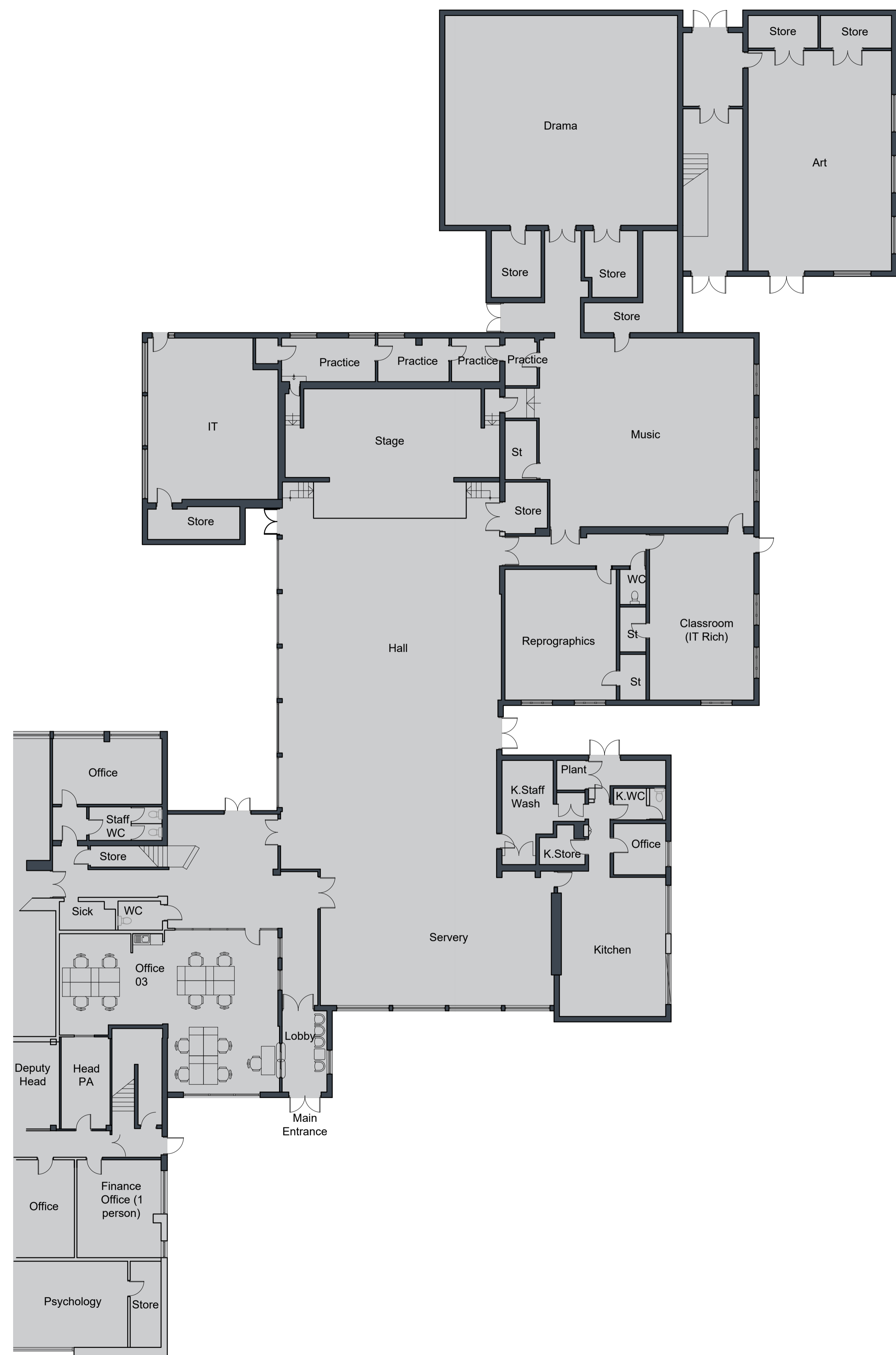
Existing Layout Plan