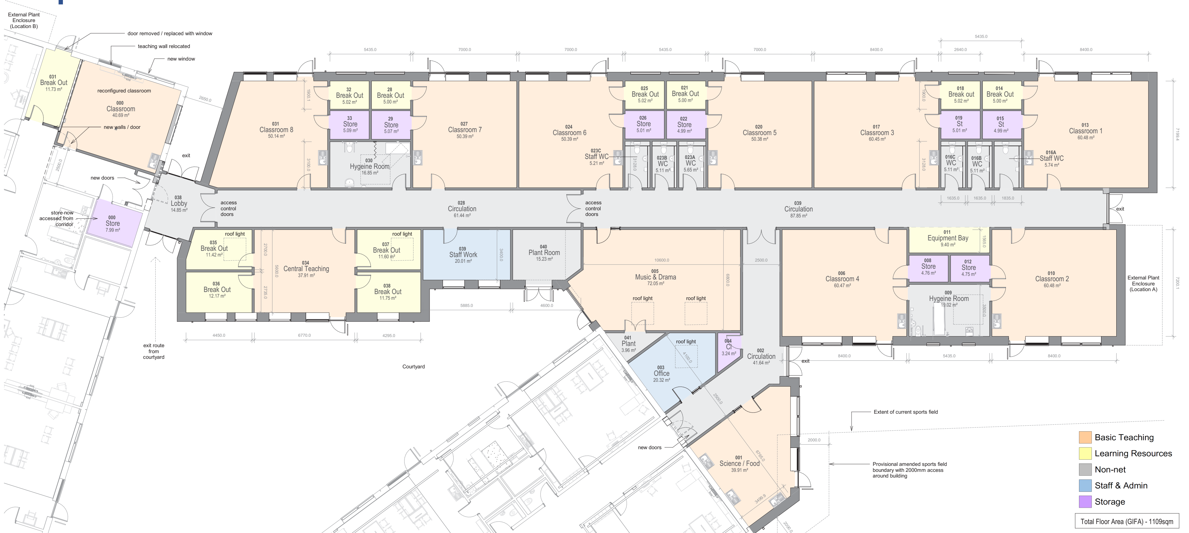
Proposed Ground Floor Plan (Not to Scale)