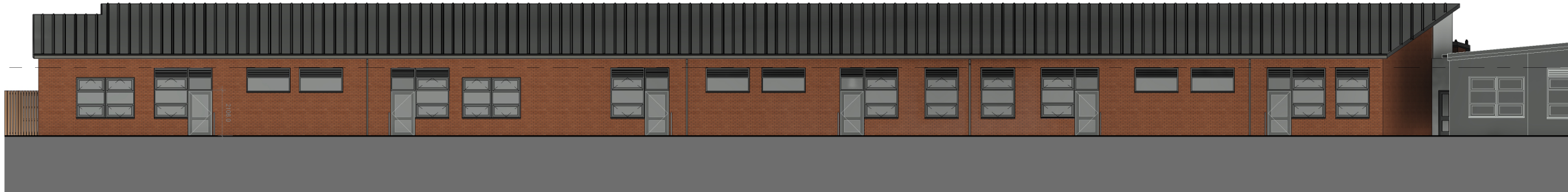
Proposed West (Courtyard) Elevation (Not to Scale)