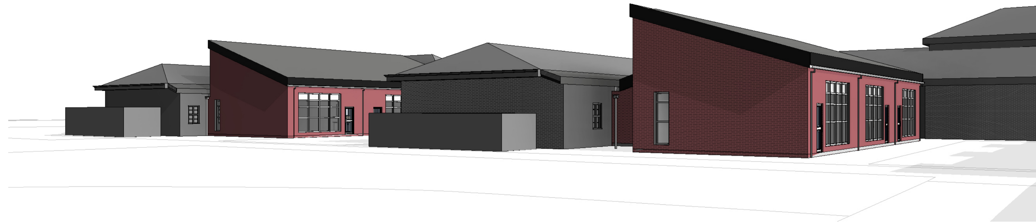
Proposed Illustrative View - V1 @ A1