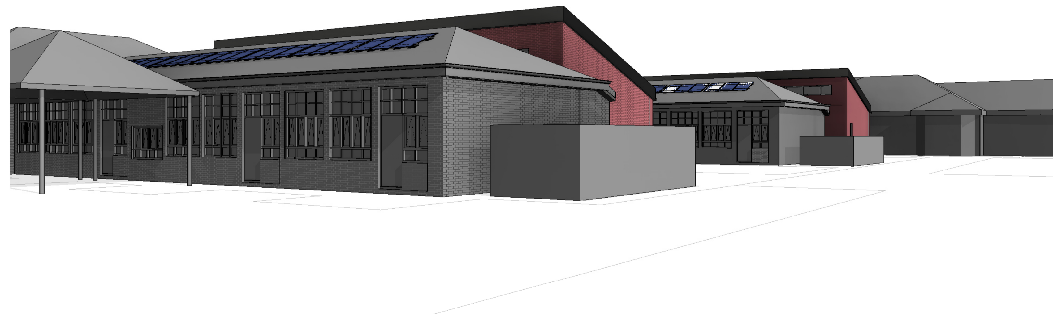
Proposed Illustrative View - V2 @ A1