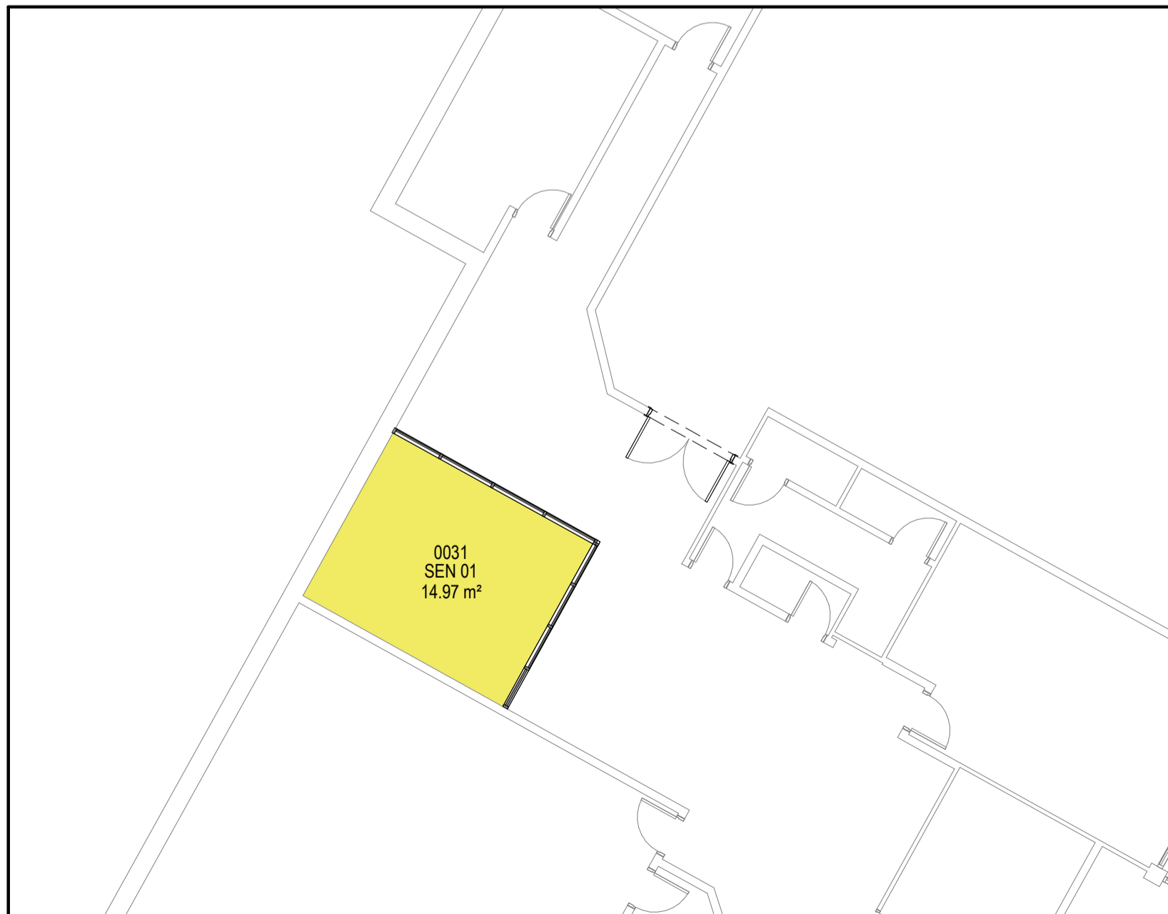
2 | Level 00 SEN01