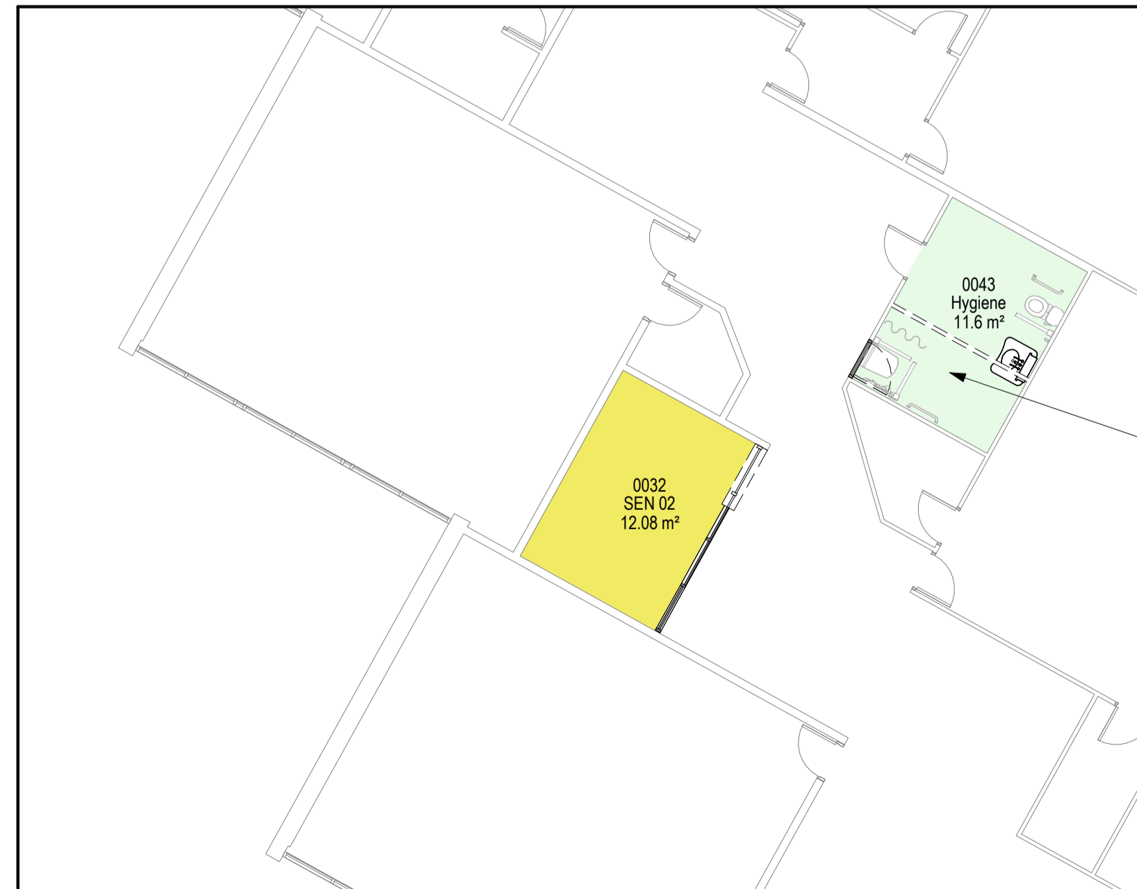
3 | Level 00 SEN02