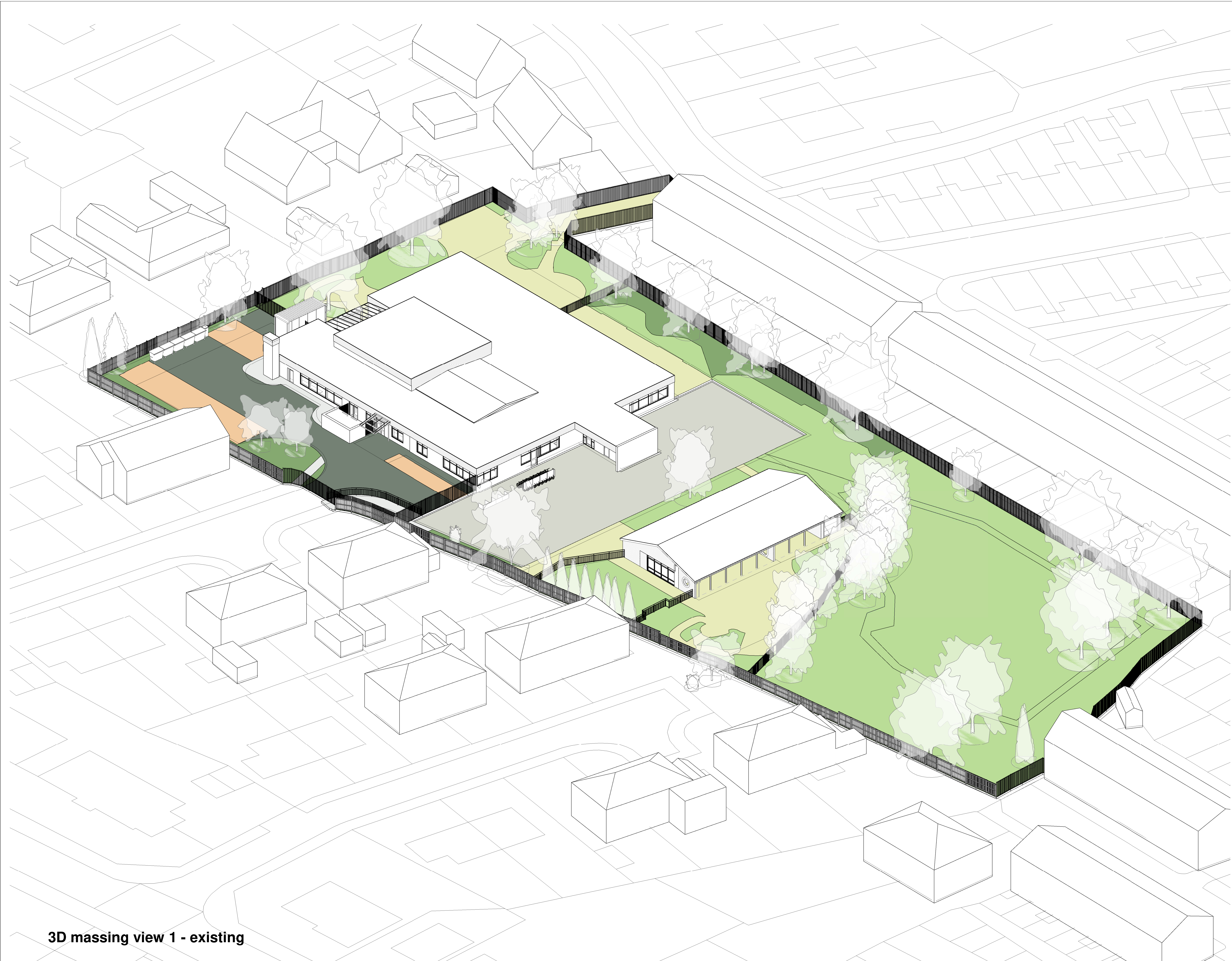
3D massing view 1 - existing

© Bowker Sadler Partnership Limited This drawing is the subject of copyright which vests in Bowker Sadler Partnership Limited. It is an infringement of copyright to reproduce this drawing, by whatever means, including electronic, without the express written consent of Bowker Sadler Partnership Limited which reserves all its rights. Bowker Sadler Partnership Limited asserts its rights to be identified as the author of this design. Drawing not to be scaled Report Errors and Omissions to the Architect. Check all dimensions on site Drawing to be read in conjunction with the Health and Safety Plan and all relevant Risk Assessments