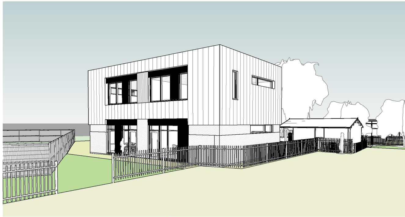
View from Reception Playground