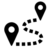
Figure 6-8: HS2 safeguarded areas